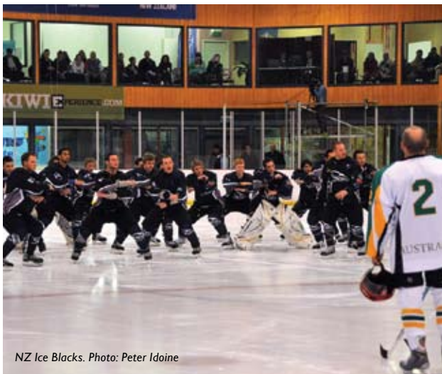
NZ Ice Blacks.

Staff from our Queenstown and Cromwell branches were eager to take in the sights and action during the week of curling at the Maniototo Curling International indoor ice rink in Naseby. While the New Zealand team was pushed out by the Koreans for the women's bronze, the line up of Olympic qualifying teams provided world class quality of curling and enthralling final games for live and televised viewers alike.