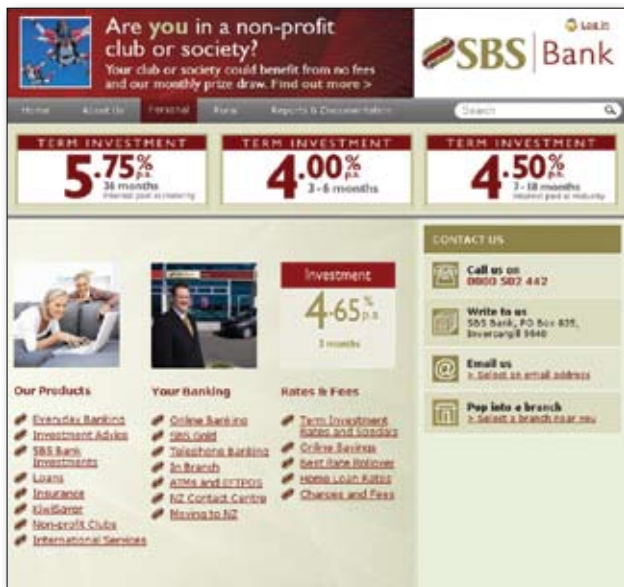
New and improved – get ready for the launch of the new SBS Bank website.

Another new feature of the website redesign is the two log-in options for internet banking (i-bank personal and i-bank legal), which will link the user to the relevant internet banking platform.