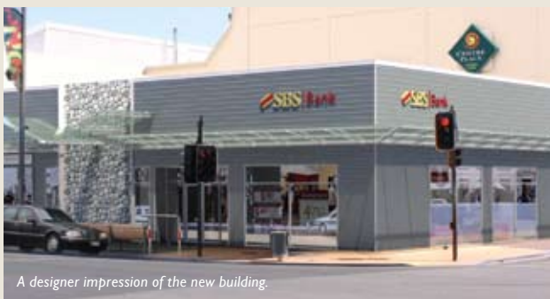
A designer impression of the new building.

Features of the additional space will include a larger waiting area with comfy couches, additional interview rooms for personal appointments, secure teller counters, increased storage, fresh new décor and, of course, the usual fantastic SBS Bank service and hot coffee waiting for anyone who pops in.