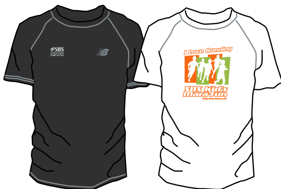
Men's T-Shirt (V-neck women's fit available)

Kids Cotton Mara'Fun t-shirt - just $20.00