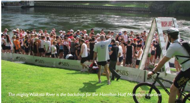
The mighty Waikato River is the backdrop for the Hamilton Half Marathon startline