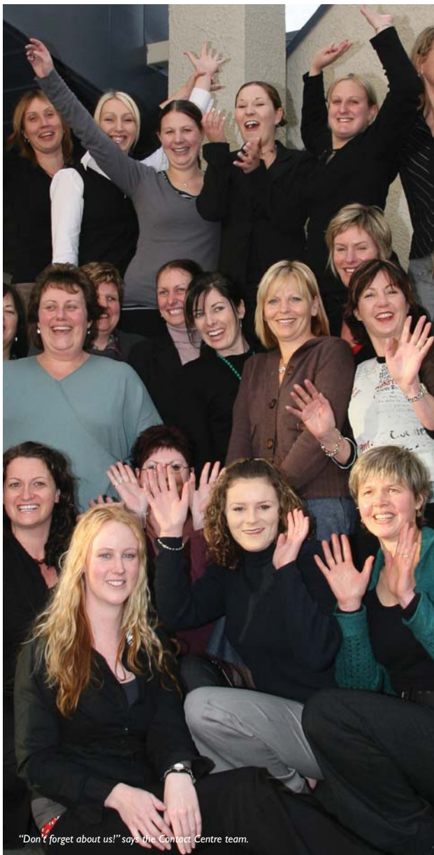
"Don't forget about us!" says the Contact Centre team.

When our Contact Centre team opened the doors to the new Best Rate Rollover feature for maturing investments, it's fair to say that the response left them a little stunned.